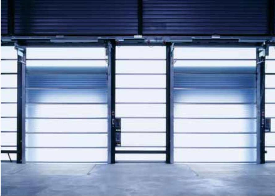
Door and gate drives are only some of the multiple applications of the new FR-D700 series.