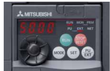
The built-in multi-user panel with Digital Dial

The FR-D700 is especially advantageous for standard applications by virtue of its user-friendliness. It is the correct choice in both simple and more sophisticated applications. Typical applications are feeder and conveyor drives, machining tools or gate and door drives.