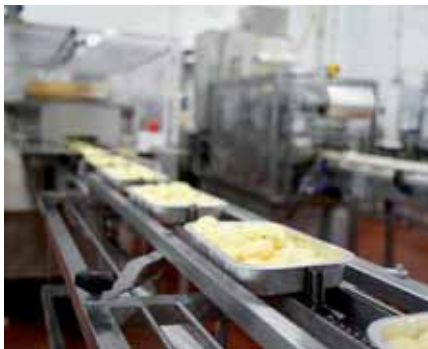
Conveyor belts and chain conveyors are an ideal application for the FR-D700.

In addition to entering and displaying various parameters, the integrated four-digit LED display also monitors and displays current operating values and alarm messages.