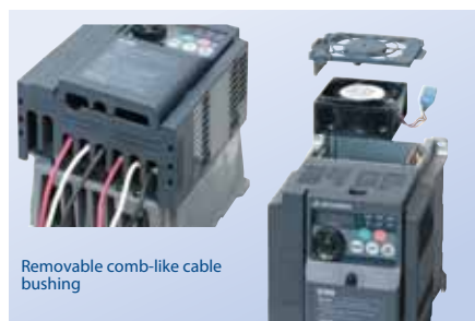
Cabling and fan replacement made easy

The fans are designed as compact units that can be replaced in less than 10 seconds for cleaning or in the event of failure.